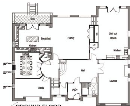
GROUND FLOOR PROPOSED window recessed 300mm back from face Access to basement from hall Below staircase.