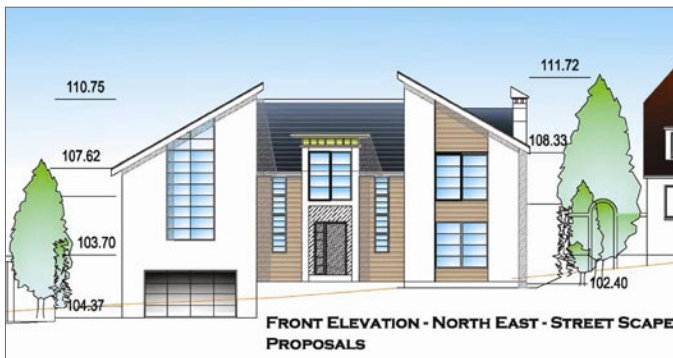
FRONT ELEVATION - NORTH EAST - STREET SCENE PROPOSALS