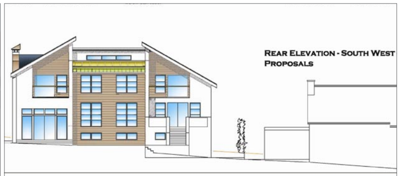
REAR ELEVATION - SOUTH WEST PROPOSALS