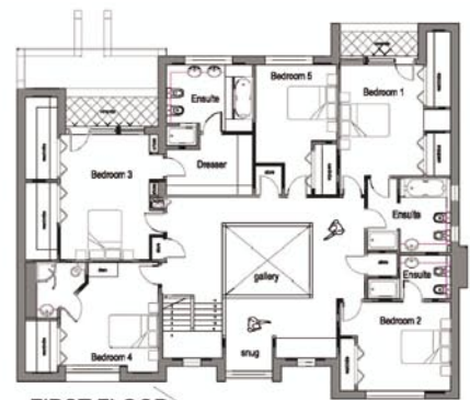
FIRST FLOOR PROPOSED window recessed 300mm back from face